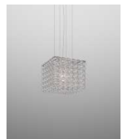
GIOGA SP CUB