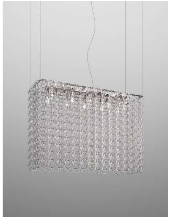
GIOGA SP RE1 CRTR CR E27 CE