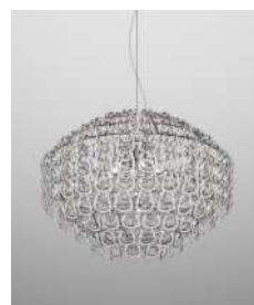
GIOGA SP 85