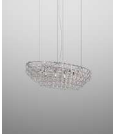
GIOGA SP OV1