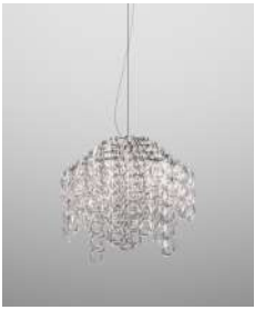
GIOGA SP JEL