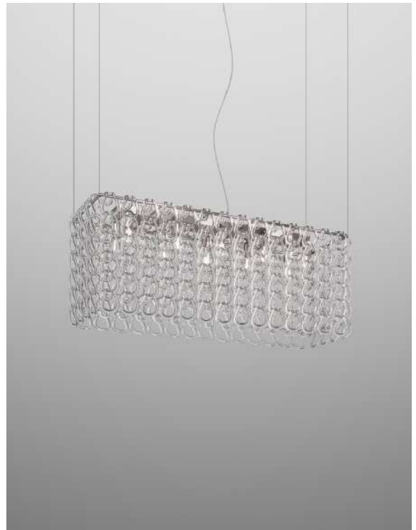
GIOGA SP R1B CRTR CR E27 CE