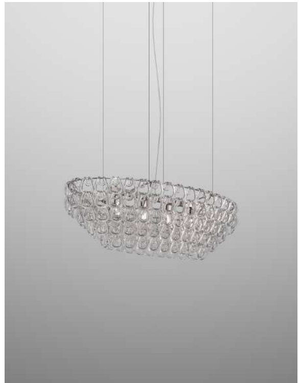
GIOGA SP OV1 CRTR CR E27 CE

A pure element: the crystal hook. It is the intuition of a master of Italian design, Angelo Mangiarotti, who in 1967 created one of the best sellers of the Vistosi catalogue, Giogali. An iconic interweaving applied to the version