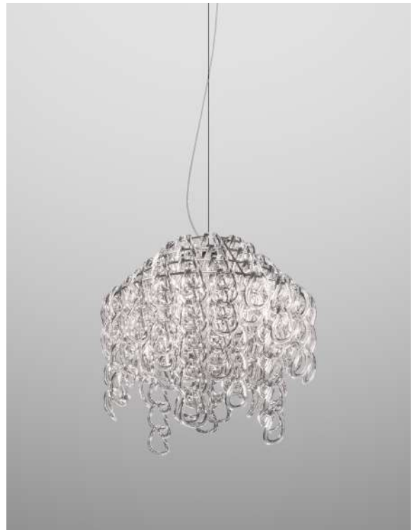
GIOGA SP JEL CRTR CR E27 CE