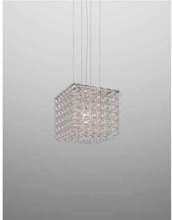
GIOGA SP CUB CRTR CR E27 CE

A pure element: the crystal hook. It is the intuition of a master of Italian design, Angelo Mangiarotti, who in 1967 created one of the best sellers of the Vistosi catalogue, Giogali. An iconic interweaving applied to the version