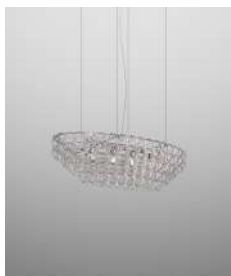
GIOGA SP OV1