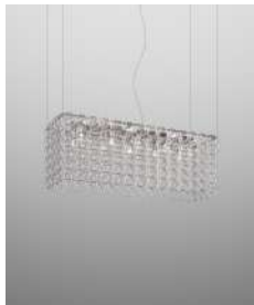
GIOGA SP R1B