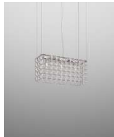
GIOGA SP RE2