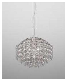
GIOGA SP 65