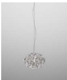
GIOGA SP 35