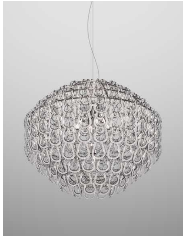
GIOGA SP 85 CRTR CR E27 CE