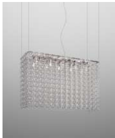
GIOGA SP RE1