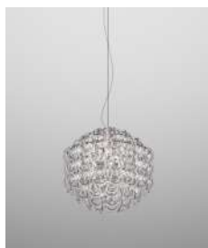
GIOGA SP 50