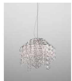
GIOGA SP JEL