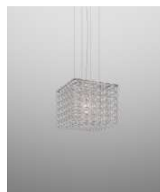
GIOGA SP CUB