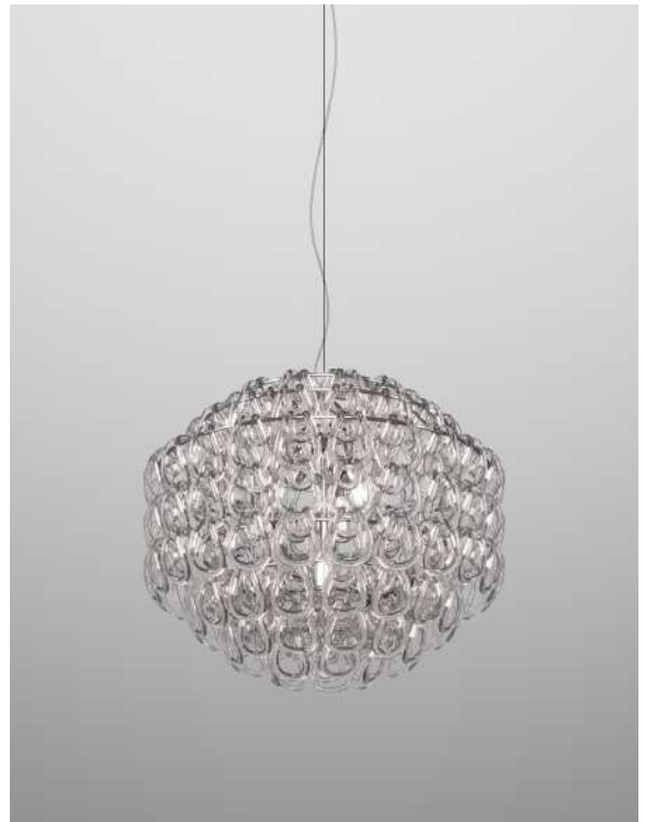
GIOGA SP 65 CRTR CR E27 CE