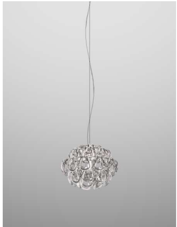
GIOGA SP 35 CRTR CR E27 CE 1

A pure element: the crystal hook. It is the intuition of a master of Italian design, Angelo Mangiarotti, who in 1967 created one of the best sellers of the Vistosi catalogue, Giogali. An iconic interweaving applied to the version