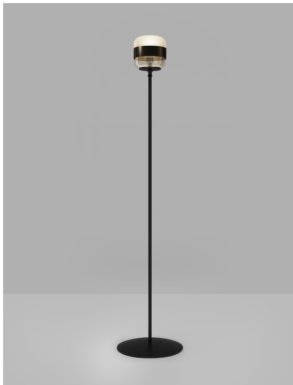
FUTUR PT P AMOT NE E27 CE