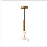
PD30502-BG/CL Brushed Gold/Clear