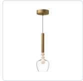
PD30501-BG/CL Brushed Gold/Clear