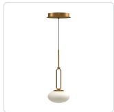
PD29806-BG Brushed Gold