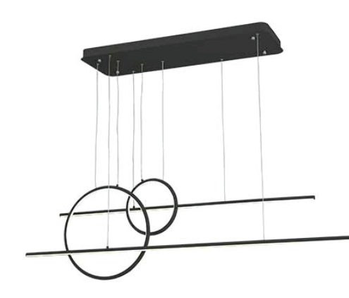
BK - Black