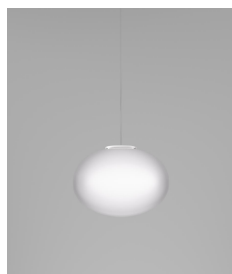
LUCCI SP 27