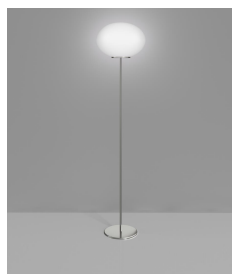
LUCCI PT M