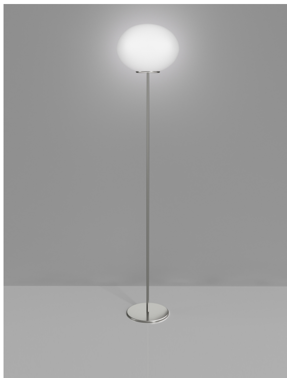
LUCCI PT M BCST NI E27 CE