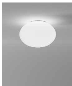
LUCCI PP P