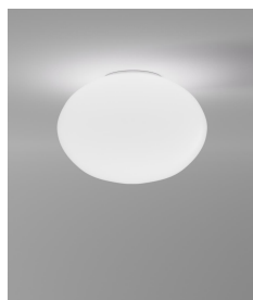
LUCCI PP M