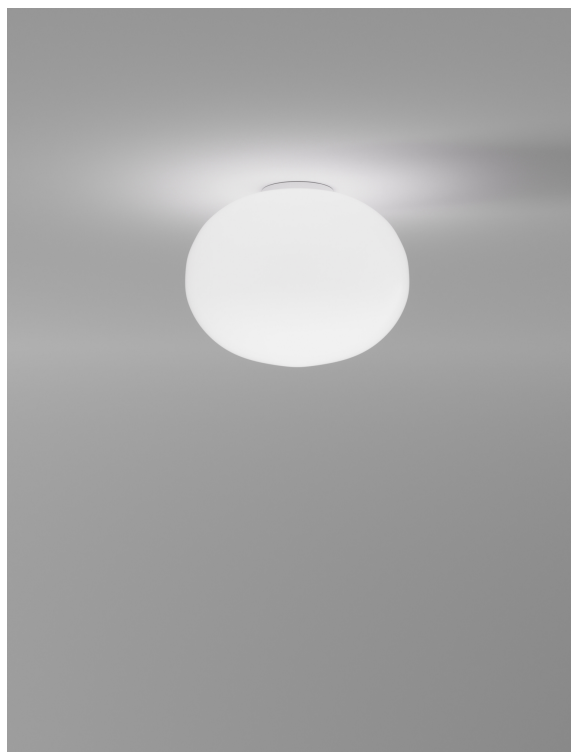
LUCCI PP 27 BCST BC 14E CE