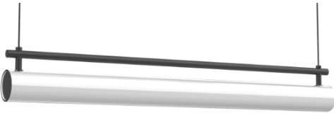
BK - Black