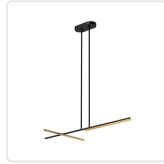
LP28748-BK/BG Black/Brushed Gold