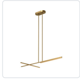
LP28748-BG Brushed Gold