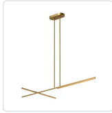
LP28760-BG Brushed Gold