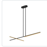
LP28760-BK/BG Black/Brushed Gold