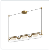
LP28543-BG Brushed Gold