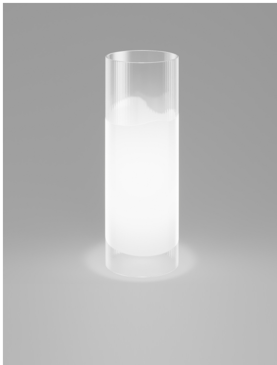
LIO LT 50 CRBC 000 E27 CE