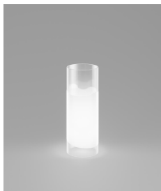
LIO LT 40