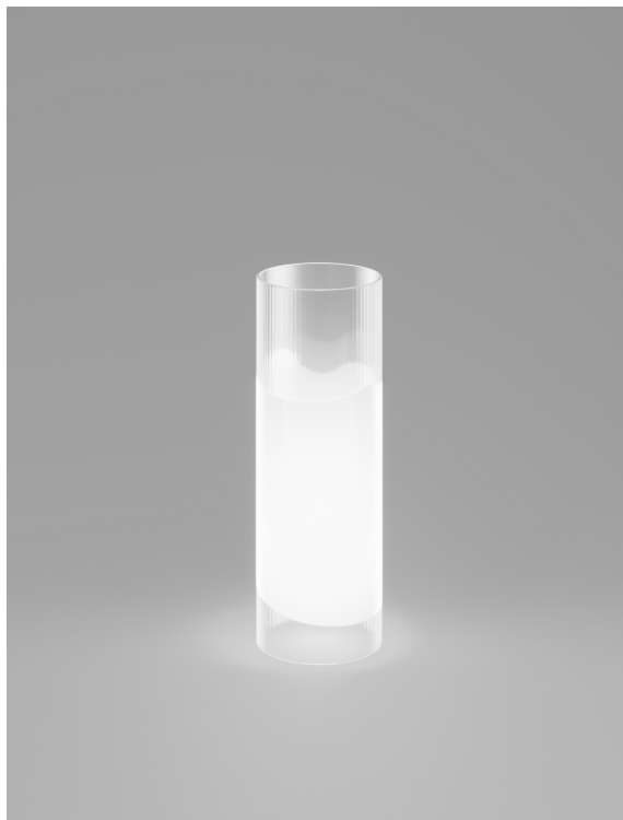
LIO LT 40 CRBC 000 E27 CE