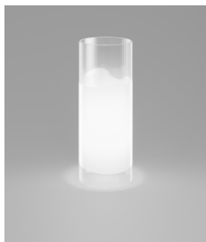
LIO LT 50