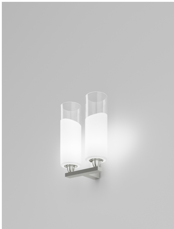
LIO AP L2 P CRBC NI G9 CE