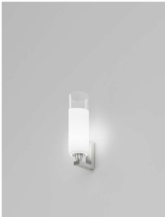
LIO AP L1 P CRBC NI G9 CE