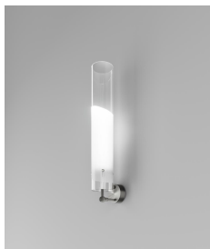
LIO AP 48