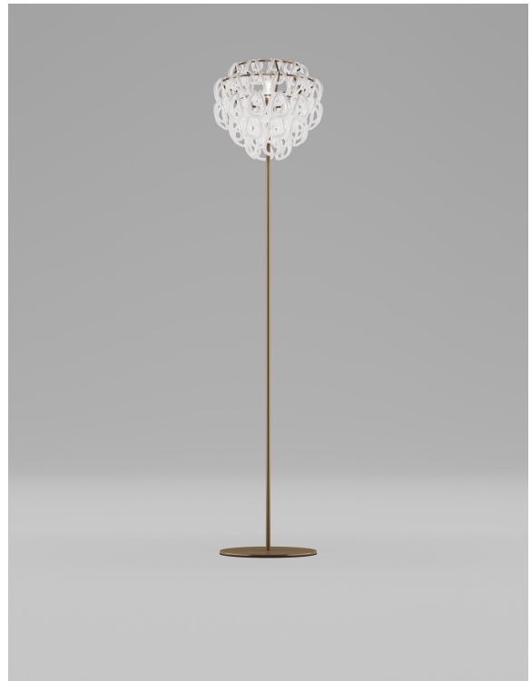
GIOGA PT BC BR E27 CE 1