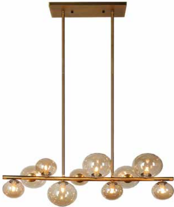
10 Light Horizontal Pendant, Vintage Bronze Finish, Champagne Glass