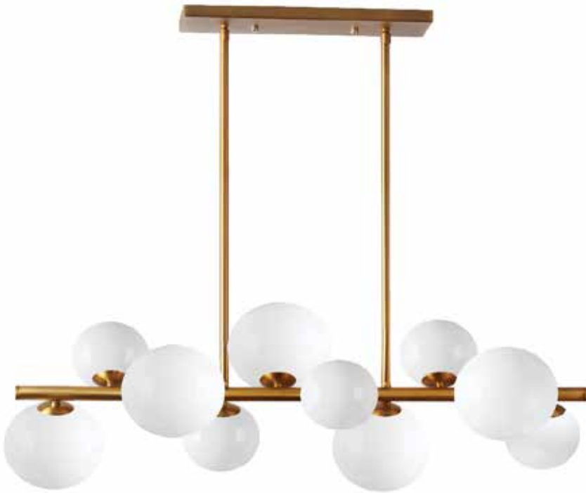
10 Light Halogen Horizontal Pendant Vintage Bronze with Painted White Glass