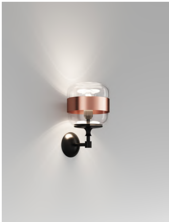
FUTUR AP P CRRA NE E27 CE