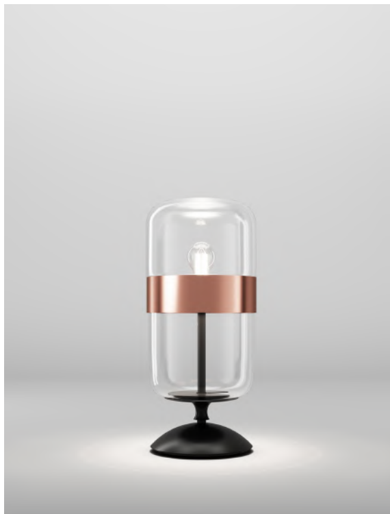
FUTUR LT M CRRA NE E27 CE