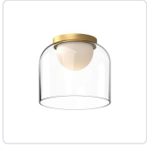
FM52508-BG/CL Brushed Gold/Clear

The charming Cedar Collection is filled with whimsical frosted glass diffusers resting inside clear glass shades. This versatile family includes a variety of different mounting options that can be mounted up, down, horizontally, or vertically. The metal base details offer a nice rigidity that compliments the soft curves found on the rest of the piece and are available in two finishes.