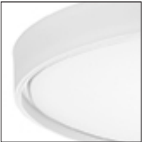
WH - White