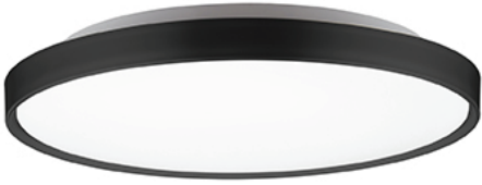
BK - Black