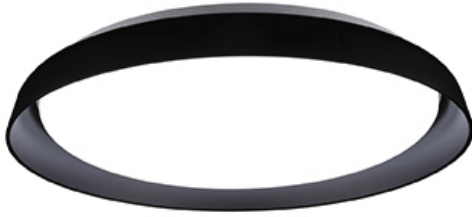
BK - Black