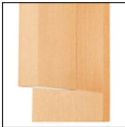
GD - Gold*