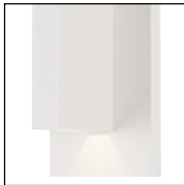
WH - White