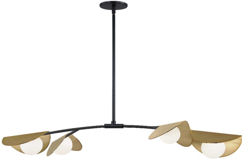
4 Light Halogen Horizontal Pendant Matte Black / Aged Brass with White Glass