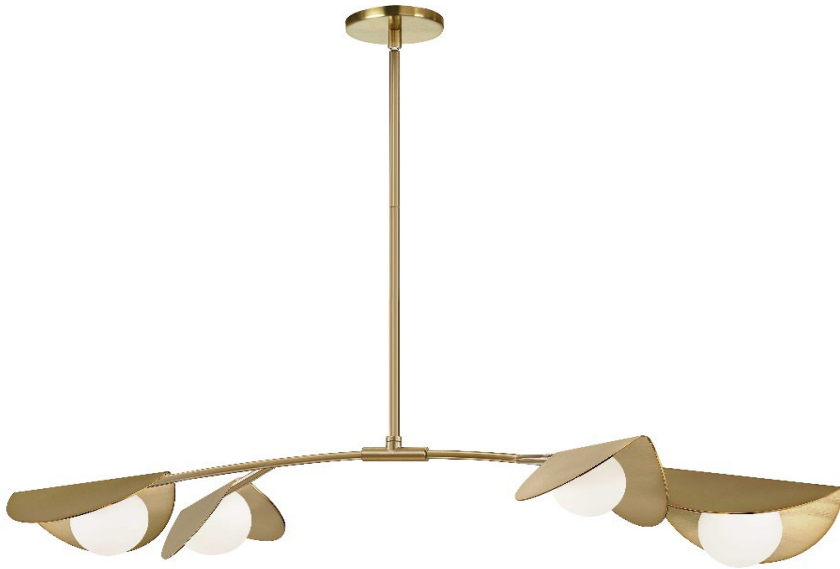
4 Light Halogen Horizontal Pendant Aged Brass with White Glass