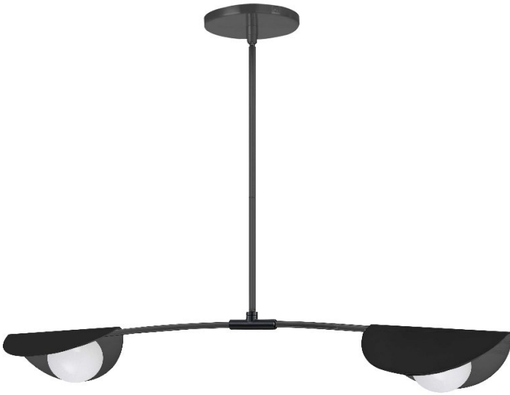
2 Light Halogen Horizontal Pendant Matte Black with White Glass