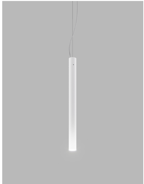
CANDE SP BCLU CR G9 CE