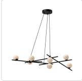
CH89854-BK/GO Black/Glossy Opal Glass