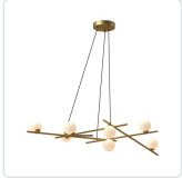
CH89854-BG/GO Brushed Gold/Glossy Opal Glass