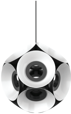
BK/WH - Black/White