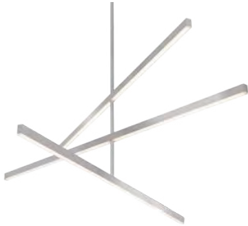
BN - Brushed Nickel