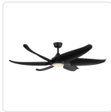
CF90960-MB Matte Black