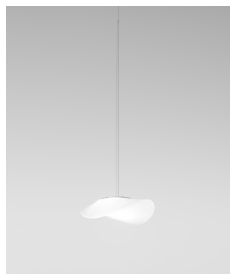
BALAN SP 24