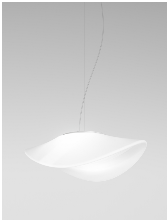
BALAN SP G BCLU NIB E27 CE