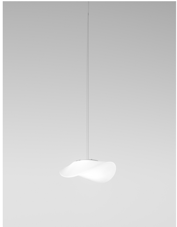
BALAN SP 24 BCLU NIB 14E CE