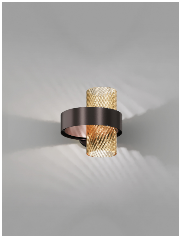
ARMON AP 25 AMRI N_R G9 CE