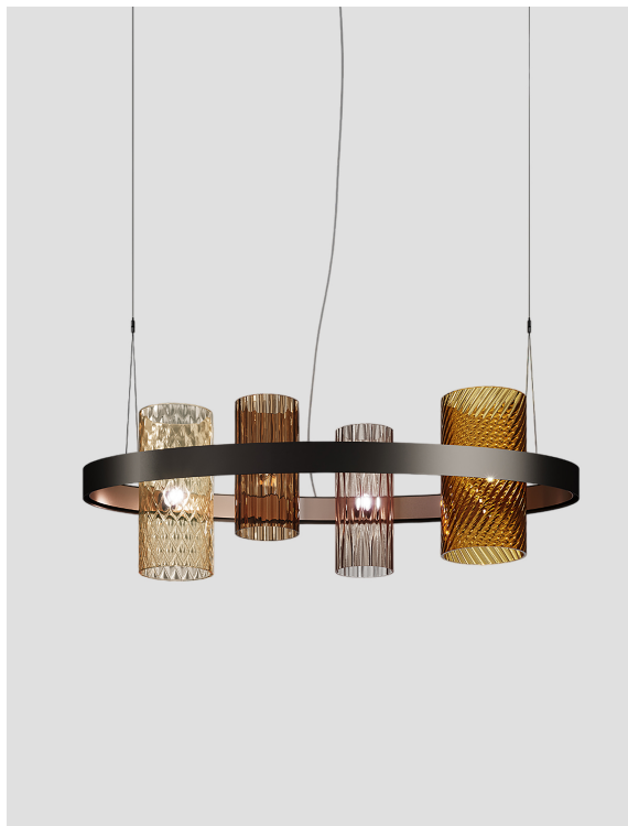
ARMON SP OV1 MC1 N_R E14 CE