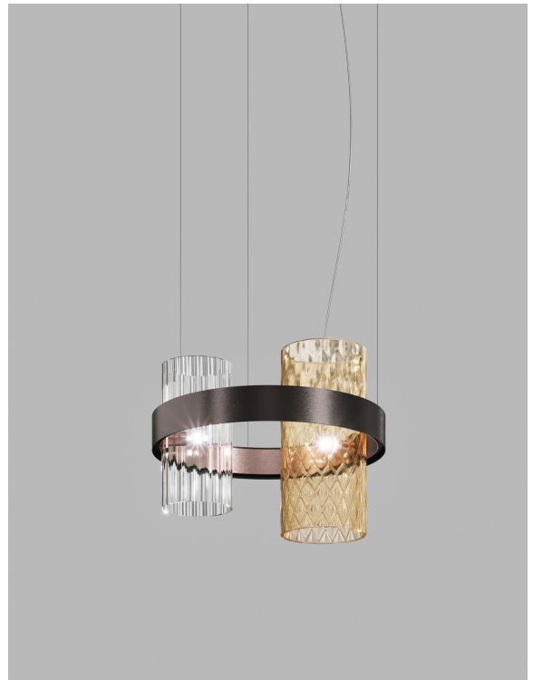
ARMON SP 50 CRAM N_R E14 CE