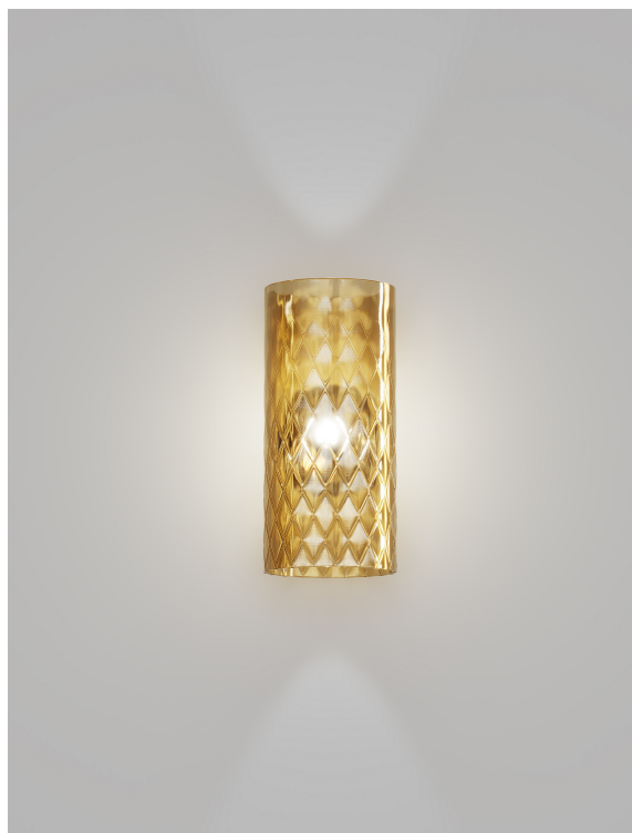
ARMON AP 18 AMBT NNS E14 CE