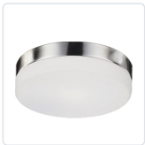
52022BN Brushed Nickel