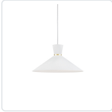
493216-WH/GD White with Gold detail