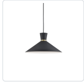
493216-BK/GD Black with Gold detail