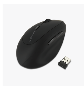
Plug-and-Play USB Connectivity

"Handshake" grip positions the hand for improved comfort.